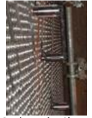
Outlet Tube Sheet